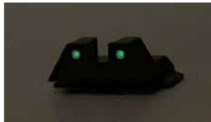
Examples of correctly glowing tritium